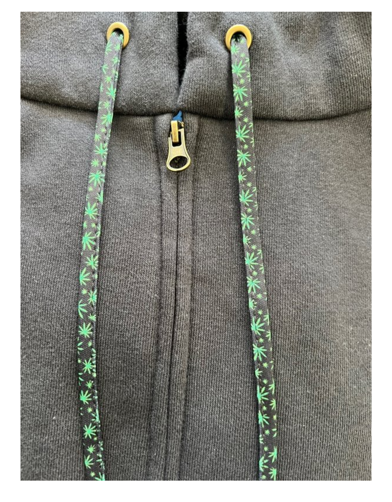
Blue Generation Recommends