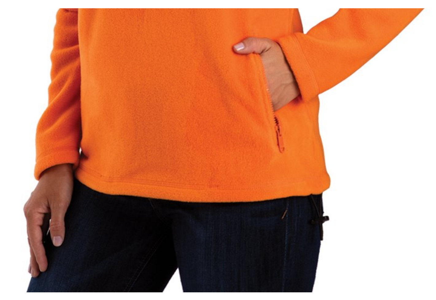
Micro Fleece Zip Pullover Jacket (BG9952H)

Made with mid-weight microfleece and featuring a custom branded collar, this pullover is sure to exceed client expectations.