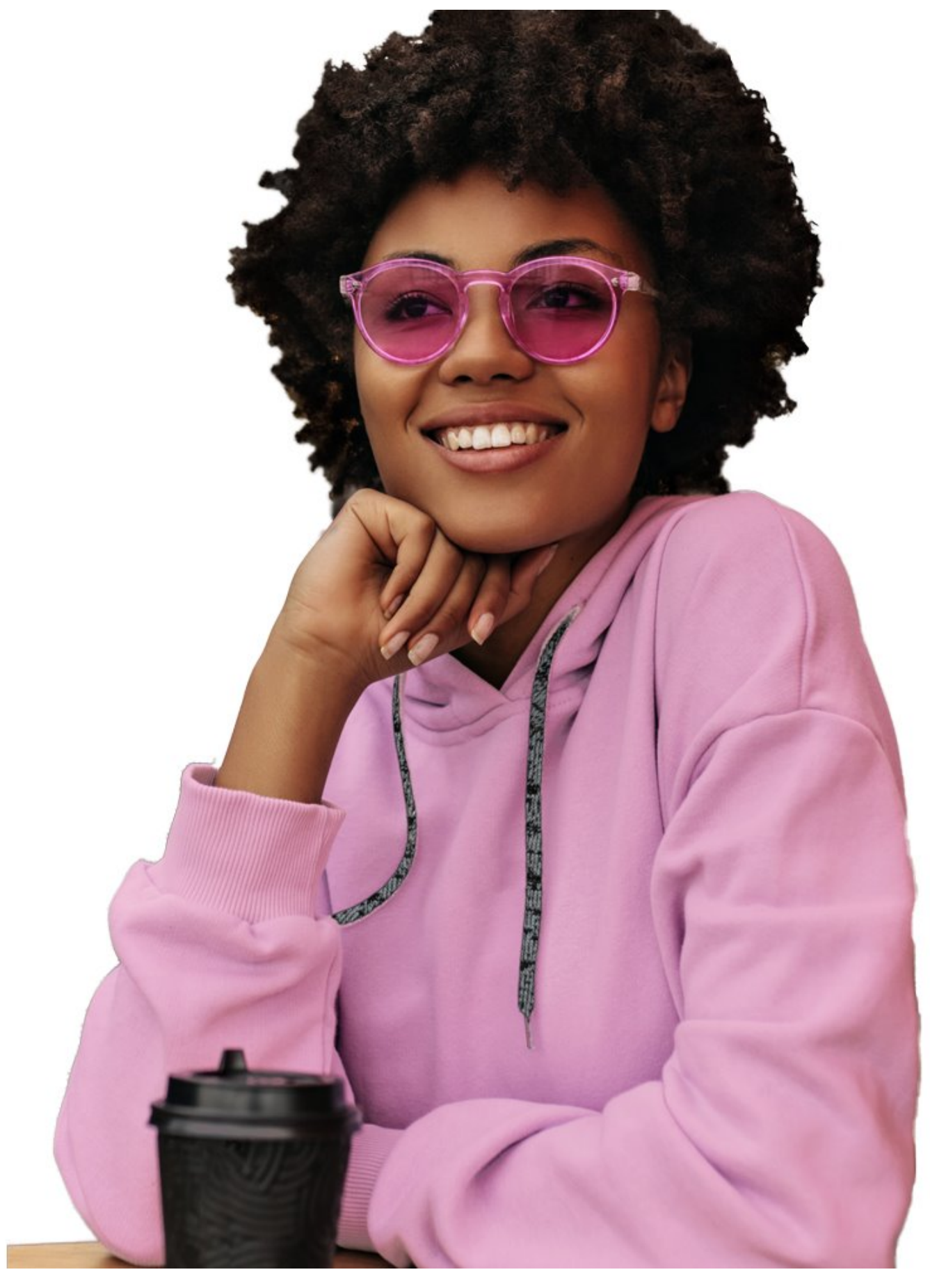
Custom Drawcord Pullover Hoodie (BG9301PD)

With 20 colorful drawcord options, custom drawcords add an extra touch of personality and flair!