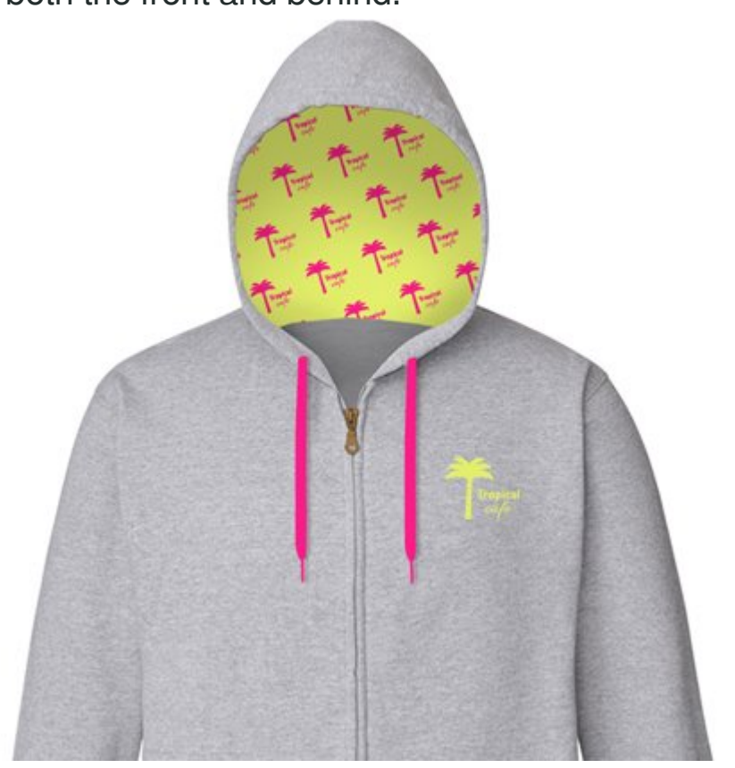
"Your Logo Here" Adult Fleece Zip Front Hoodie (BG9302ZD)

Whether hoods are worn up or down, the inside hood location is guaranteed to deliver more impressions as branding can be seen from both the front and behind.