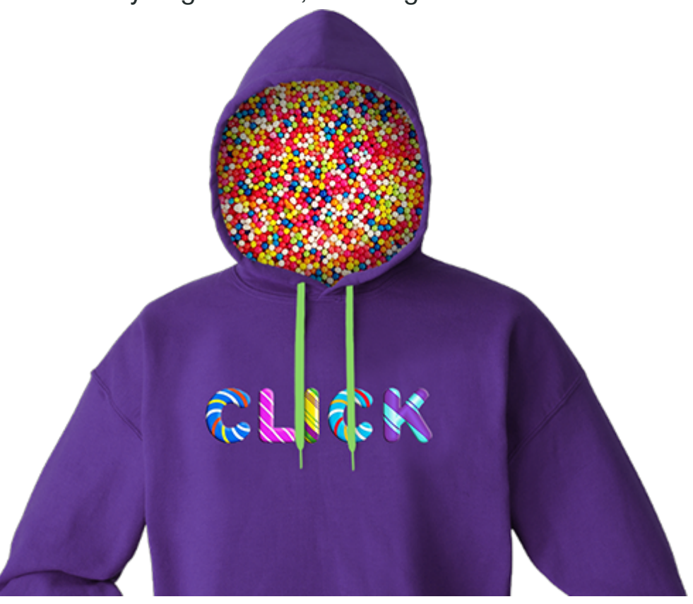
"Your Logo Here" Adult Fleece Pullover Hoodie (BG9301PD)

Let clients know that every time someone sees these triblend hoodies with decorated hoods they'll stop the wearer to ask, "Where did you get that?", resulting in excellent word-of-mouth advertising.