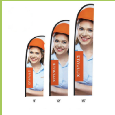
9' Premium Double Sided Straight Flag Graphic Only (CPN-554067154)

With impressive height and full-color graphics that can't be overlooked, this double-sided flag is the perfect way to direct passersby to your client's booth or store.