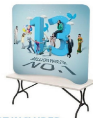
6' Tube Curved Double-Sided Fabric Display With Frame (CPN-554114692)

Attract attention with this larger-than-life tube display, decked out with high-resolution, full-color graphics.