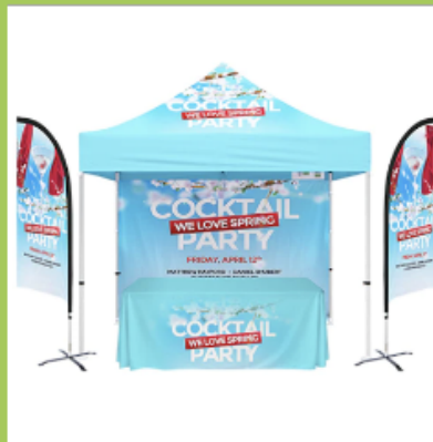
10' x 10' Custom Tent Packages #5 (CPN-554023559)

With impressive height and full-color graphics that can't be overlooked, this double-sided flag is the perfect way to direct passersby to your client's booth or store.