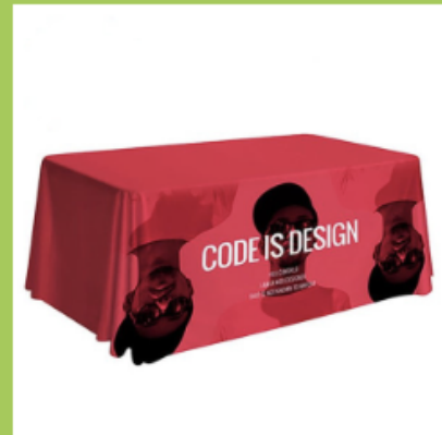
6-ft. Premium Table Throw 4-Sided - Close Back, Full-Color Dye (CPN-554020713)

Complete with all the bells and whistles – including a full-color tent, backwall, two flags and a table throw – this tent package has everything your clients need to succeed.